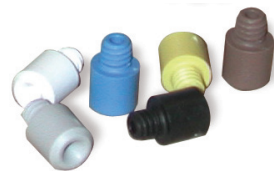
Metering Tips Part #NA0816A