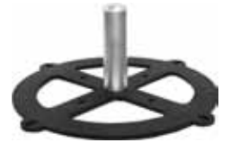
HP0008-3INBRUTE Motor Mounted Weight Post Kit