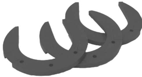
A0032-1P -- Optional 25# Horseshoe Weights (each) A0032-3P -- Optional 36# Horseshoe Weights (each)