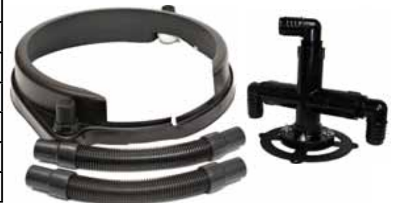
Dust Pick-Up System For a BRUTE Machine