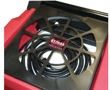
Convenient storage for power cord and drain hose.

The R250 marks Phoenix Restoration Equipment's continuing commitment to technology, performance and durability.