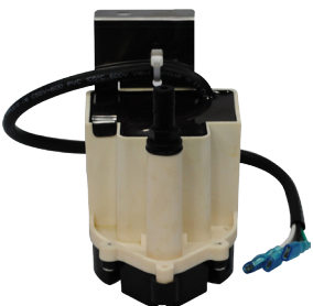
Heavy-Duty Condensate Pump