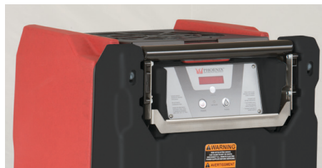
Telescoping handle retracts to make unit compact for transport and storage.