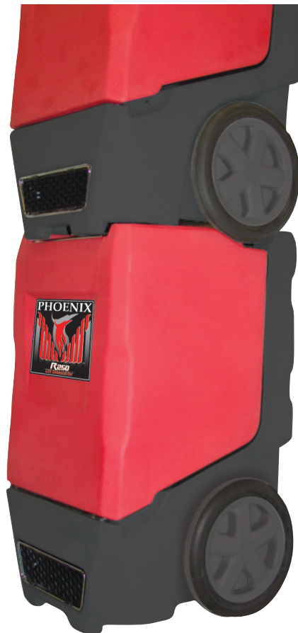
Units stack upon themselves for easy storage.