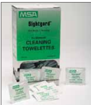
Pictured Pre-Moistened Towelettes, 4 oz. Fog Proof

In today's Protective Eyewear market, MSA is committed to providing the latest eyewear styles. We are pleased to announce the expansion of our Sightgard Line of Protective Eyewear to include several new styles: the Sedona, Pyrenees, Alpine and our Arctic Elites. All models are available through MSA now!! We have also expanded our product line with a complete line of accessories, including pre-moistened towelettes, disposable cleaning stations, lanyards, and display units.