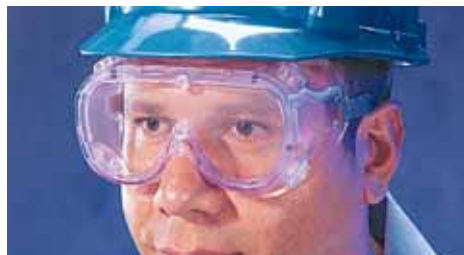
Softframe 4-Vent Single Lens Goggles

Softframe Goggles effectively fit most facial contours. Large, one-piece, .060-inch-thick polycarbonate lens provides wide, undistorted field of vision. Optional Anti-Fog Coated Lenses are available for work involving high humidity, temperature changes or greater worker exertion. The scratch-resistant coating is unaffected by most organic solvents, ammoniacal and alkaline detergents.