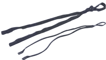
Top: Deluxe Lanyard Bottom: Standard Lanyard