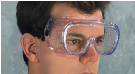
Softframe Perforated Single Lens Goggles