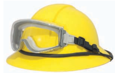
S521 hard hat not included