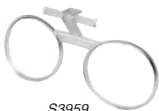
*Uvex Stealth Rx lens insert.