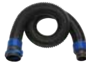
Self-Adjusting Breathing Tube SG-30W

All Speedglas™ Breathing Tubes feature the innovative 3M™ Quick Release Swivel (QRS) Connection, to allow for a quick connection and minimize loops and kinks.