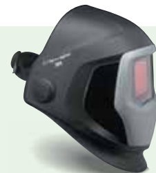
Available with Side Windows