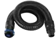
Sound-Dampening Breathing Tube SG-50W