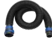
Heavy-Duty Breathing Tube SG-40W