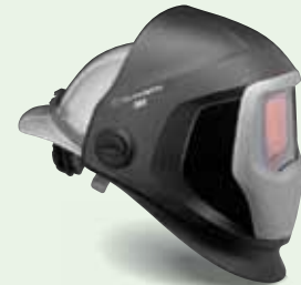
Available with Hard Hat