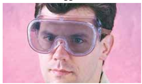
Wire Screen Goggles feature a clear nonvented frame, wire lens, and elastic headband.