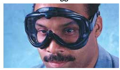
For use where fine dust in high-velocity concentration is a problem and where minor impact hazards exist.