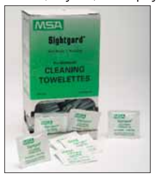
Pictured Pre-Moistened Towelettes, 4 oz. Fog Proof

In today's Protective Eyewear market, MSA is committed to providing the latest eyewear styles. We are pleased to announce the expansion of our Sightgard Line of Protective Eyewear to include several new styles: the Sedona, Pyrenees, Alpine and our Arctic Elites. All models are available through MSA now!! We have also expanded our product line with a complete line of accessories, including pre-moistened towelettes, disposable cleaning stations, lanyards, and display units.