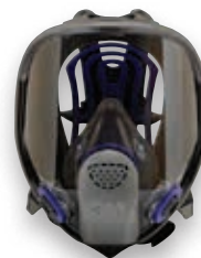
Ultimate FX FF-400