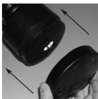
motion for attaching spark cover