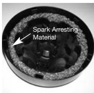
check for spark arresting optional material

Note: The spark arresting material inside the spark cover is optional.