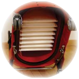
Oversized filtration efficiently removes large quantities of dust