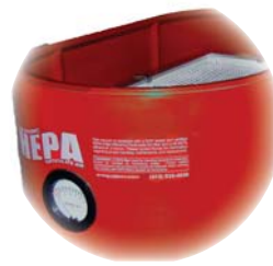
Optional HEPA for absolute filtration. 99.997% efficient at 0.3 Microns.