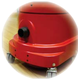
Low inlet for easy portability and prevents tipping