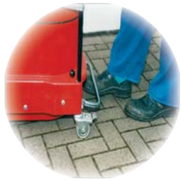
Foot-actuated dustpan makes emptying easy and dust-free