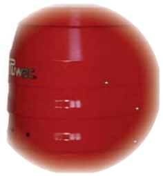
Compression cast composite housing is durable and dent-free