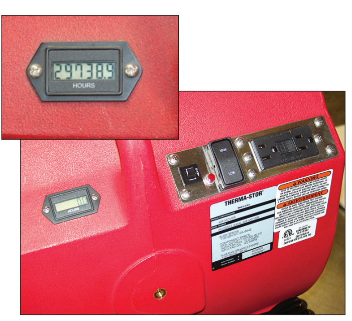
Innovative control panel includes power-on light, run-time hour meter, GFCI outlet and more.