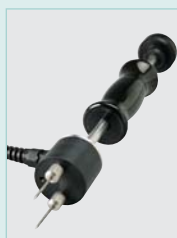
MO290-HP Moisture Hammer Probe