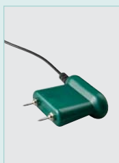
MO290-P Moisture Pin Probe