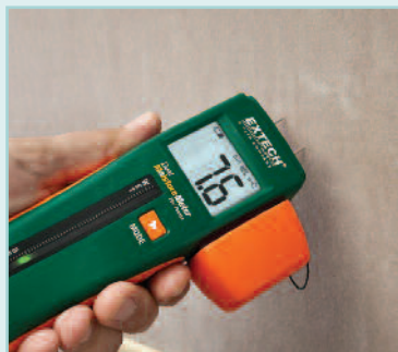
Measures % of Moisture in sheet rock and other building materials using direct pin method. Protective cap snaps onto the side of the housing during use.