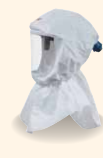
3M™ Versaflo™ Hood Assembly S-655

Head, face, neck and shoulder coverage. Its respiratory seal is a comfortable, knitted inner collar that is shorter and thinner than previous models. General purpose, cost-effective fabric.