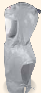
3M™ Versaflo™ Hood Assembly S-857

Similar to S-655 but made with Kappler® Zytron® 200, a polypropylene fabric with a multi-layer barrier film. Features sealed seams, making it suitable for environments where certain liquid splash hazards may be present. Includes a comfortable inner collar.