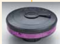
450-00-01R12 High Efficiency Particulate (HE) Cartridge