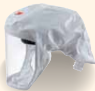
3M™ Versaflo™ Headcover S-133

Head and face coverage. Fabric suspension.