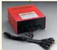
520-03-72 Five Battery Charger