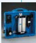
256-02-00 (50 cfm) with CO Filtration and Monitor