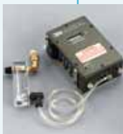
W-2808 / 37027 CO Monitor Retrofit Kit

IMPORTANT: These filter and regulated panel products do not produce Grade-D breathing air. The employer is required to ensure that the compressed air used with any supplied air system meets the requirements for Grade-D breathing air per the Compressed Gas Association Commodity Specification G-7.1-1997. In Canada, refer to CSA Standard Z180.1 for the quality of compressed breathing air.