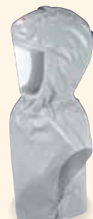
3M™ Versaflo™ Hood Assembly S-855

Similar to S-657 but with a fabric specifically intended to help capture paint overspray, minimizing the potential for paint to flake off the wearer and onto the work piece. Fabric has an internal film barrier to help prevent paint contact with skin or clothes.