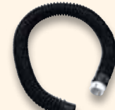
520-01-00R0 (Approx. 36")