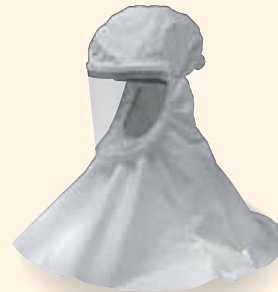
3M™ Versaflo™ Economy Hood S-403

Head and face coverage. Integrated Comfort suspension, blue Tychem® QC fabric.