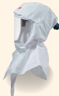
3M™ Versaflo™ Hood Assembly S-757 / 37301

Similar to S-655. The S-657 uses a double shroud design for its respiratory seal; wearers can select their preferred seal design. The S-657 is worn by tucking the inner shroud into a shirt or protective coverall, allowing excess air to be channeled over the body.