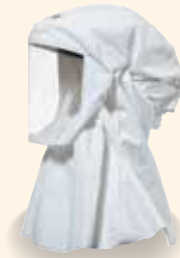
3M™ Versaflo™ Hood S-533

Head, face, neck, and shoulder coverage. Fabric suspension, inner shroud.