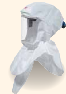
3M™ Versaflo™ Hood Assembly S-657

Head, face, neck and shoulder coverage. Its respiratory seal is a comfortable, knitted inner collar that is shorter and thinner than previous models. General purpose, cost-effective fabric.