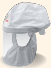
3M™ Versaflo™ Economy Headcover S-103

Head and face coverage. Fabric suspension.