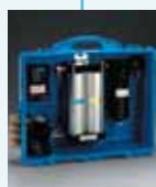
256-02-01 (100 cfm) with CO Monitor