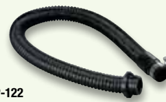
GVP-122 Breathing Tube