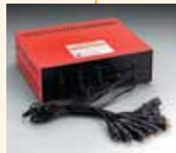
520-01-61 Ten Battery Charger