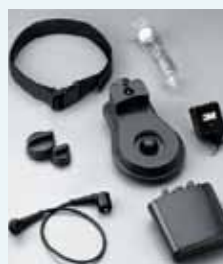
NiCd Battery GVP-1 Standard Belt GVP-1U Urethane Belt GVP-CB Comfort Belt