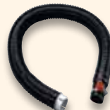
520-03-32R01 (Approx. 33")