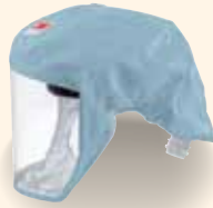
3M™ Versaflo™ Headcover S-133B

Head and face coverage. Integrated Comfort suspension. General purpose fabric.