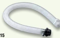
H-115 Breathing Tube