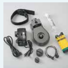
NiMH Battery GVP-1NiMH Standard Belt GVP-1UNiMH Urethane Belt GVP-CBNiMH Comfort Belt