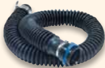
BE-324 (Approx. 36")