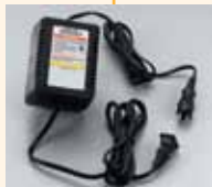
520-03-73 Single Battery Charger